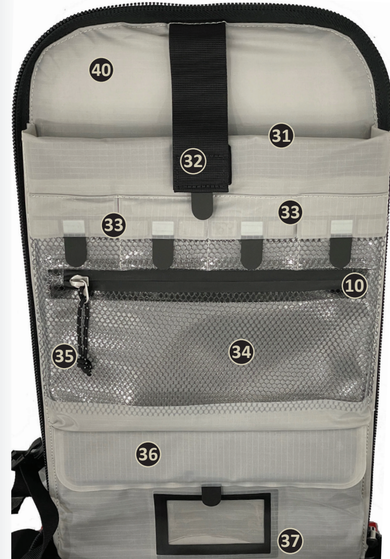
BACK PANEL INTERIOR VIEW